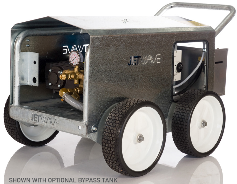
SHOWN WITH OPTIONAL BYPASS TANK